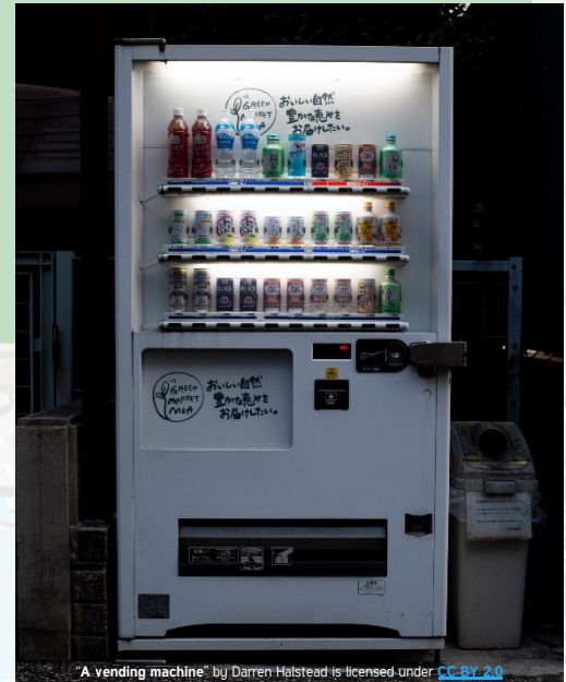
"A vending machine"

What would you want to buy from a vending machine?